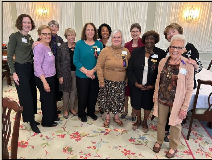
Our Gamma Phi chapter was well represented as always!