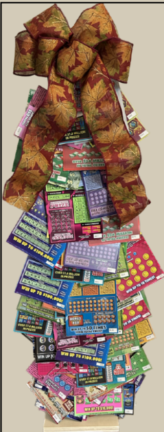
Our lottery tree was the most popular raffle item!