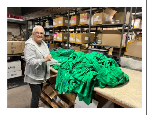
A few fun memories from our volunteer days at Brand Evolutions