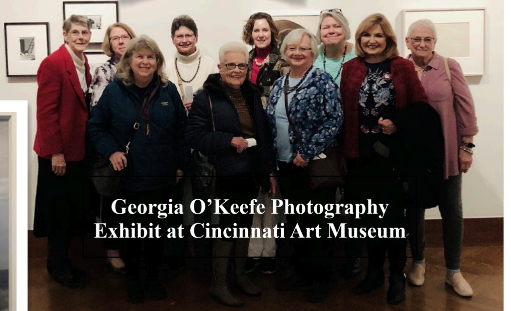
Georgia O'Keeffe Photography Exhibit at Cincinnati Art Museum