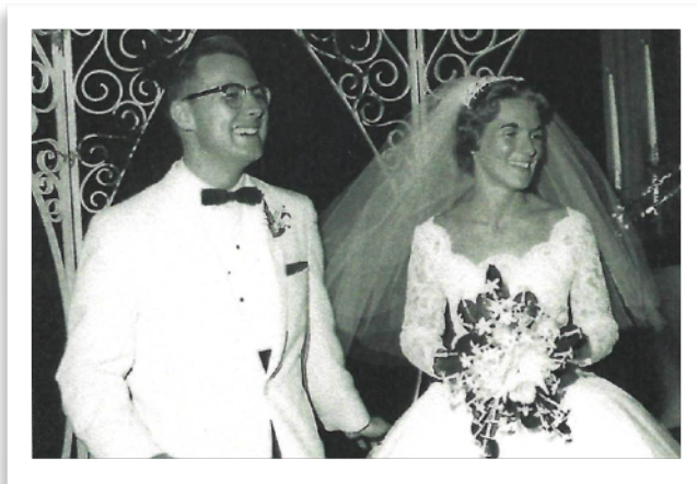
The Happy Couple on their wedding day 60 years ago