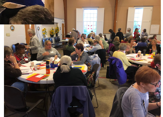
Columbus Ohio October 20th