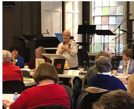
The Alpha Delta State Executive Board Meeting