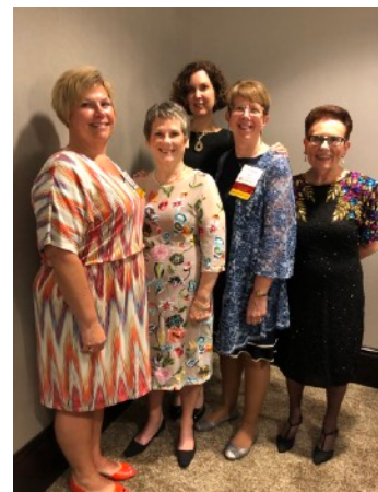
Saturday Night Banquet attendees all dressed up for the occasion!