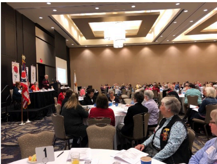
Saturday Second General Session