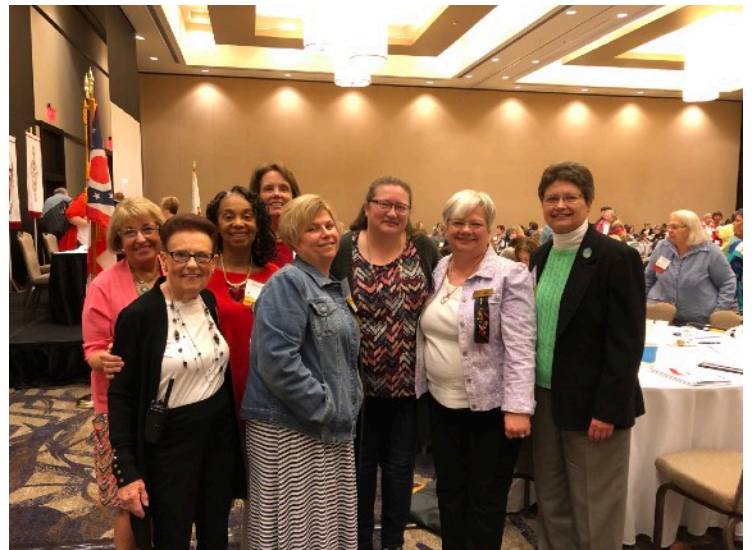
What a Great Looking Group of Ladies!

Enjoy the photos on the following few pages as we highlight all of the great events throughout the special convention weekend!