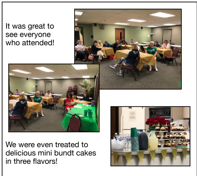
It was great to see everyone who attended!