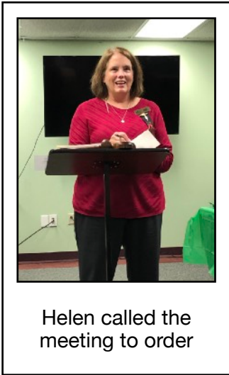
Helen called the meeting to order