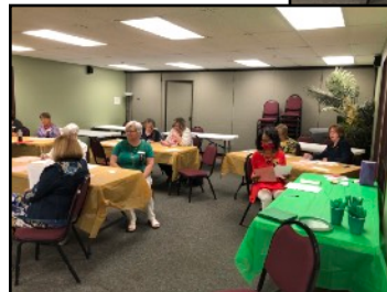
We were even treated to delicious mini bundt cakes in three flavors!