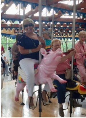
Carol Ann's Carousel